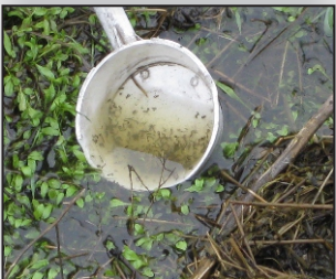
Immature mosquitoes (larvae) look like tiny worms at the surface or swimming in the water.

The San Gabriel Valley Mosquito & Vector Control District